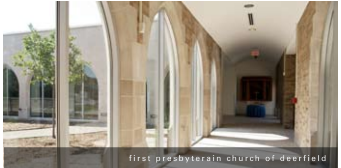
first presbyterian church of deerfield

Each year, more than a hundred projects are submitted to the Illinois Indiana Masonry Council for their annual Excellence in Masonry awards. We are pleased to announce that two of Holabird & Root's projects were selected to receive awards. Dominican University's Parmer Hall received a Silver Award and the First Presbyterian Church of Deerfield was honored with the Craftsmanship Award . Each project serves as an example of the innovation and close collaboration our project teams utilize to create successful solutions for our clients.