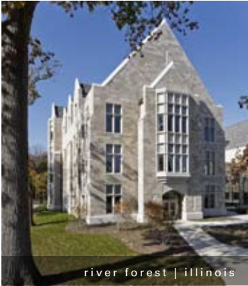
river forest | illinois