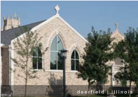
deerfield | illinois