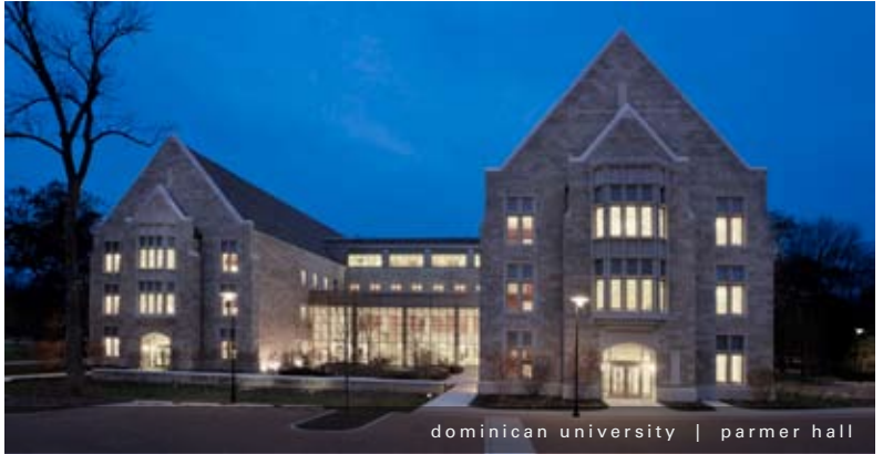
dominican university | parmer hall